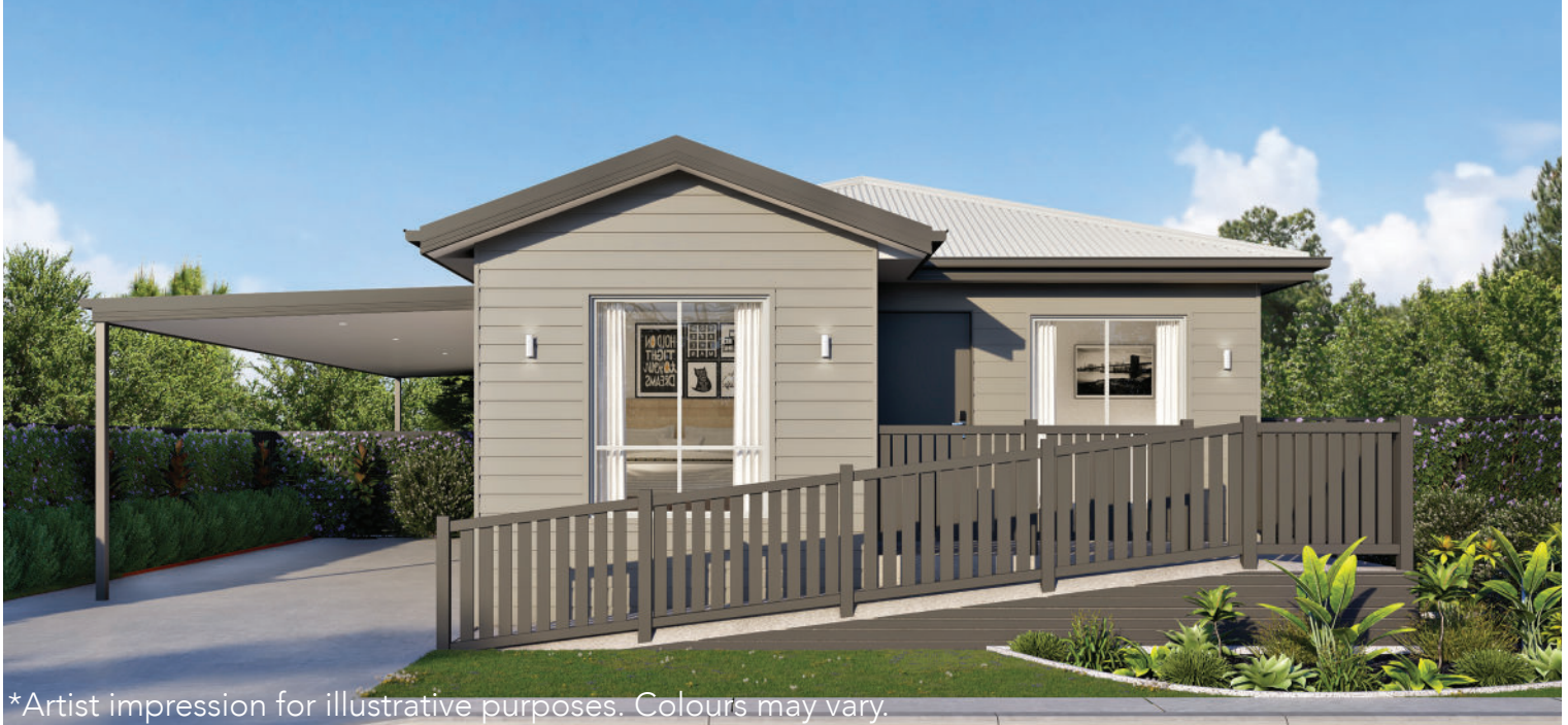
*Artist impression for illustrative purposes. Colours may vary.