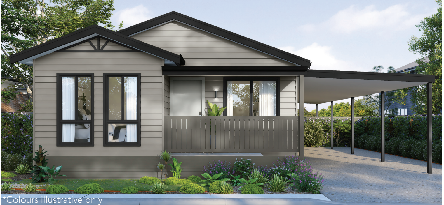
*Colours illustrative only