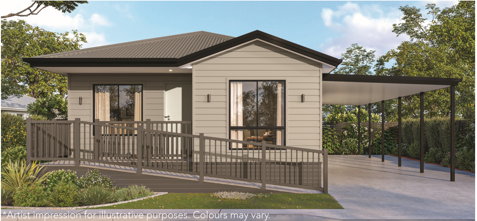
*Artist impression for illustrative purposes. Colours may vary.