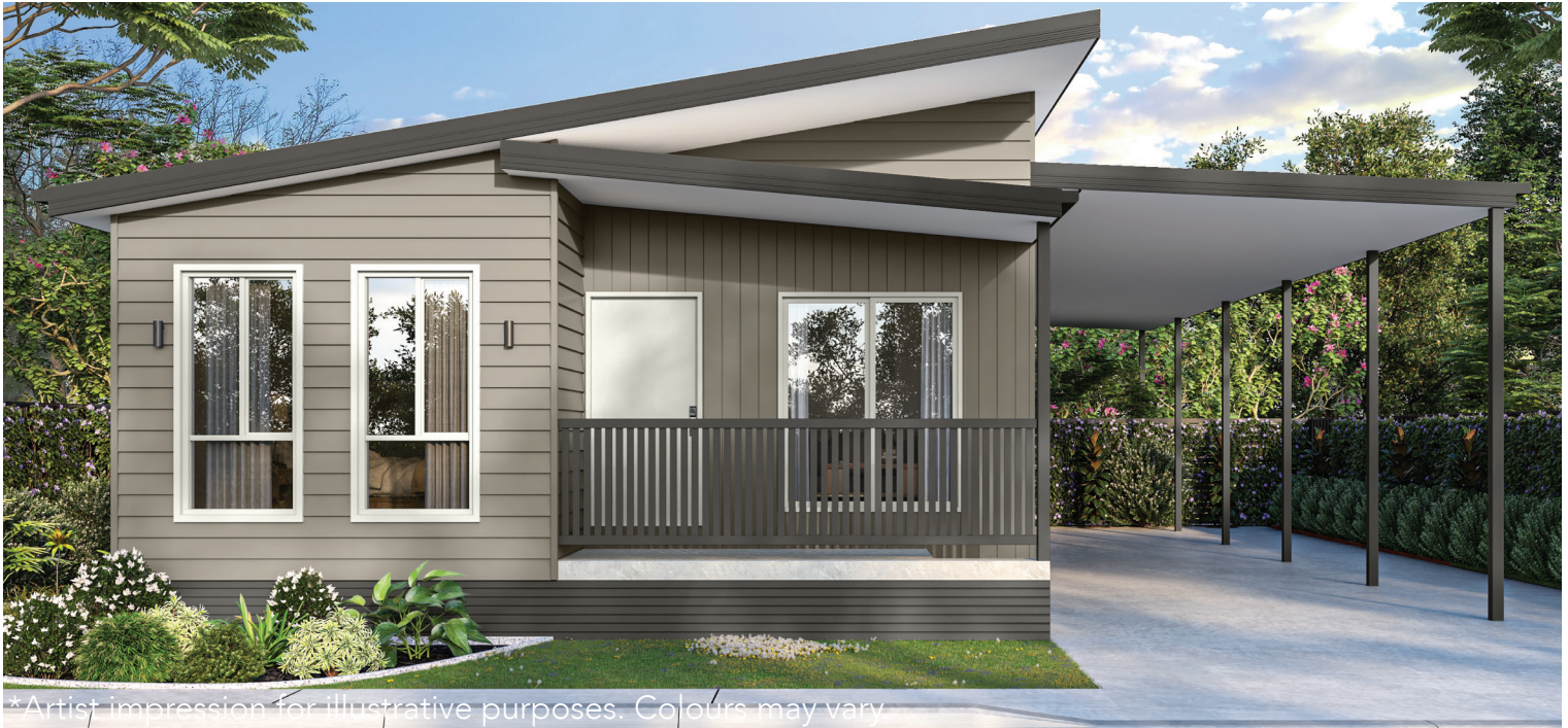
*Artist impression for illustrative purposes. Colours may vary