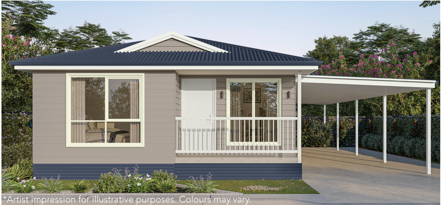
*Artist impression for illustrative purposes. Colours may vary.