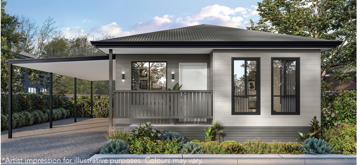
*Artist impression for illustrative purposes. Colours may vary.