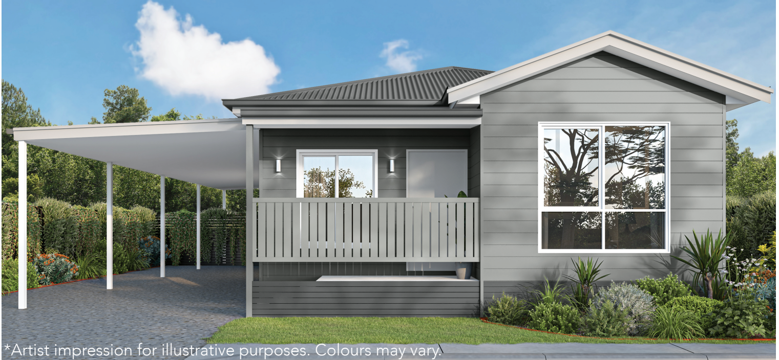
*Artist impression for illustrative purposes. Colours may vary.