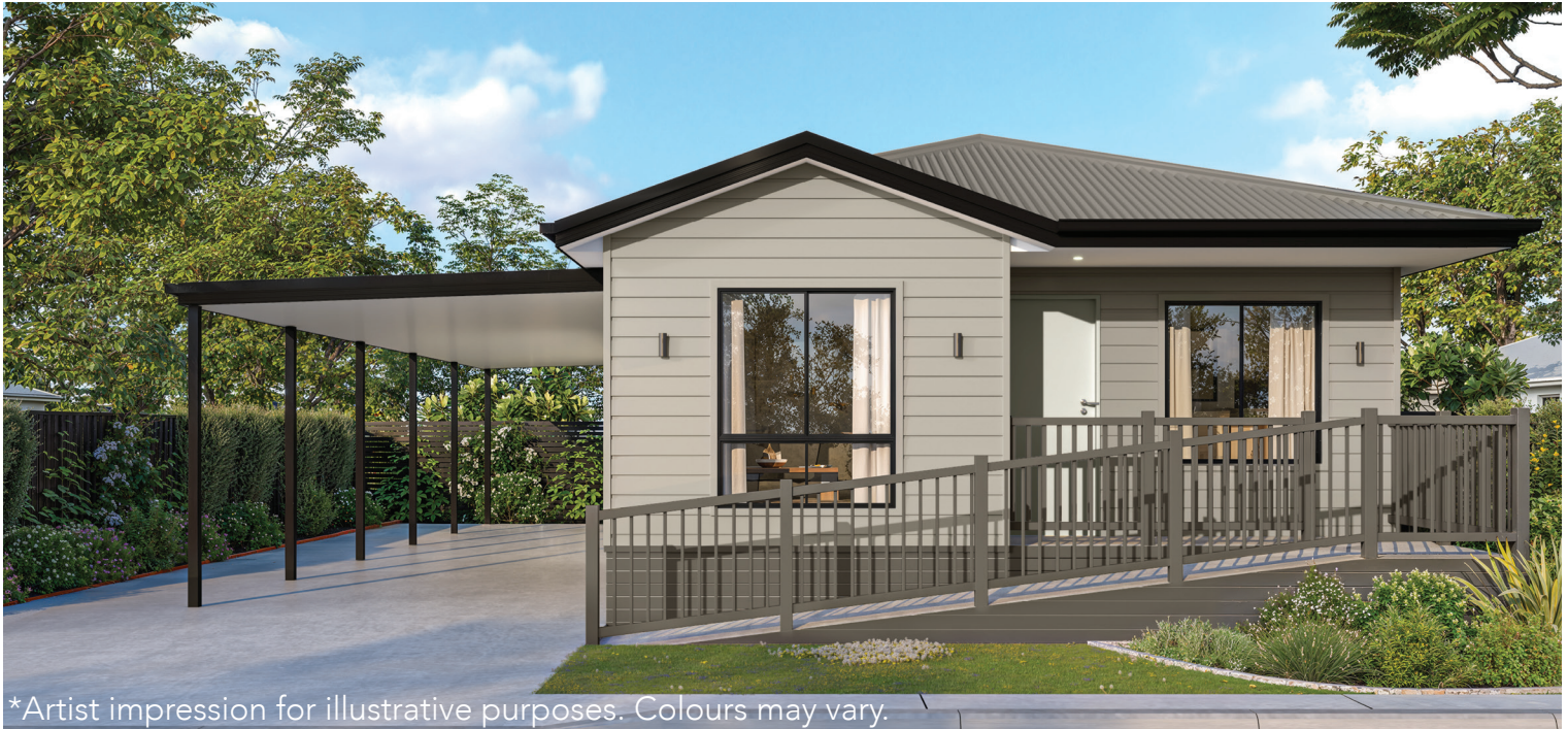
*Artist impression for illustrative purposes. Colours may vary.