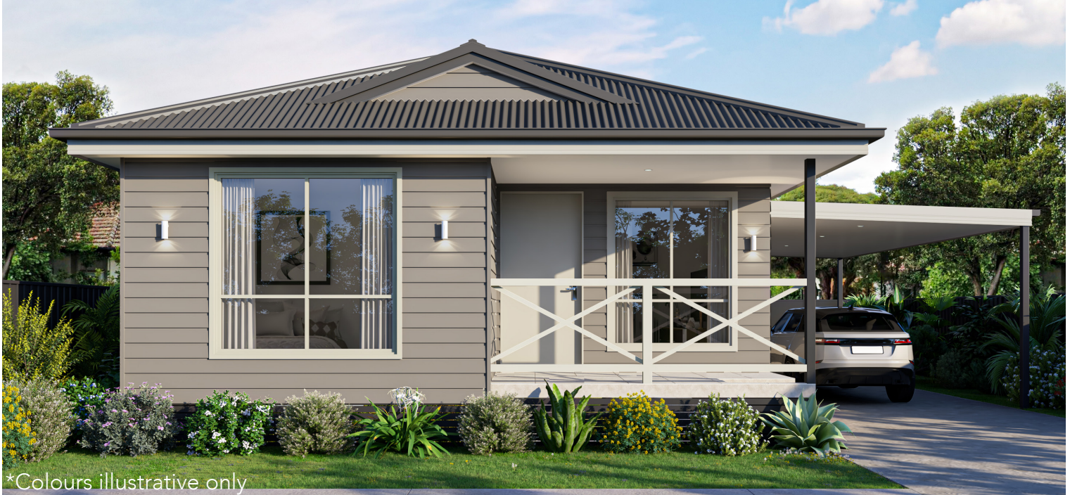
*Colours illustrative only