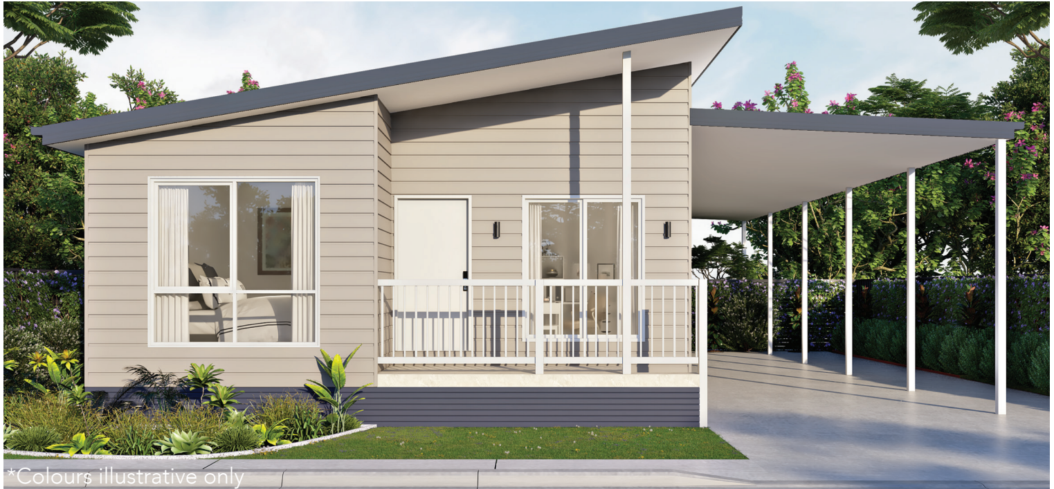
*Colours illustrative only