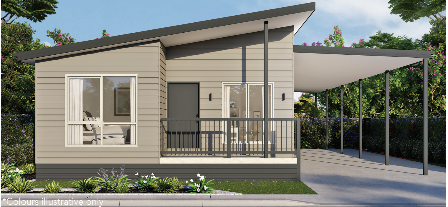
*Colours illustrative only