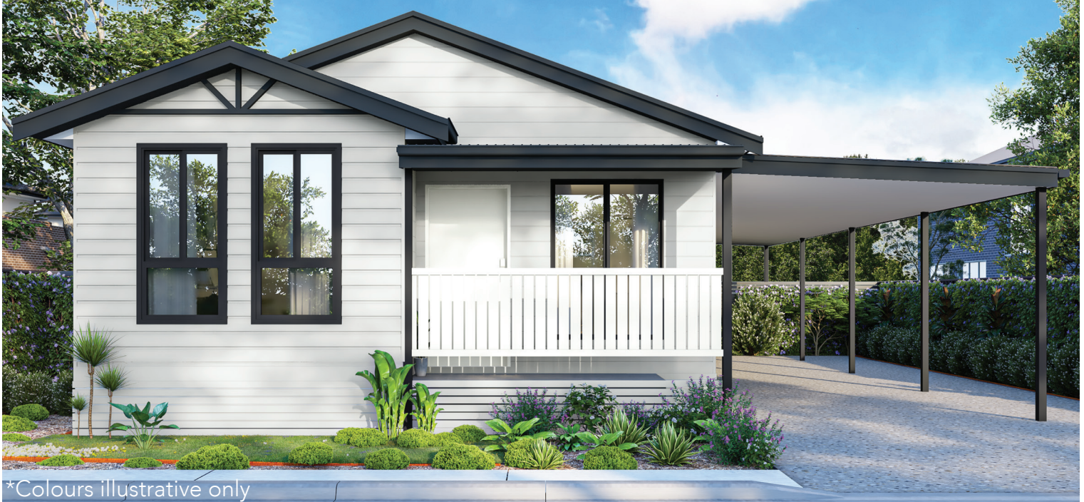
*Colours illustrative only