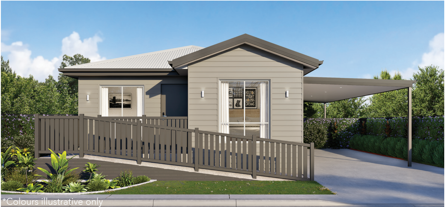
*Colours illustrative only