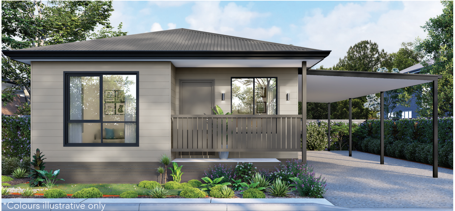
*Colours illustrative only