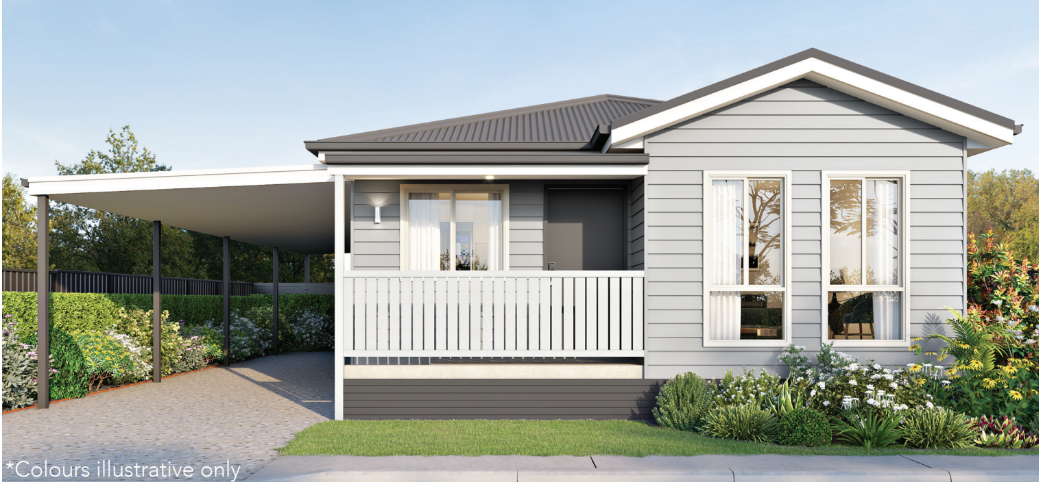
*Colours illustrative only