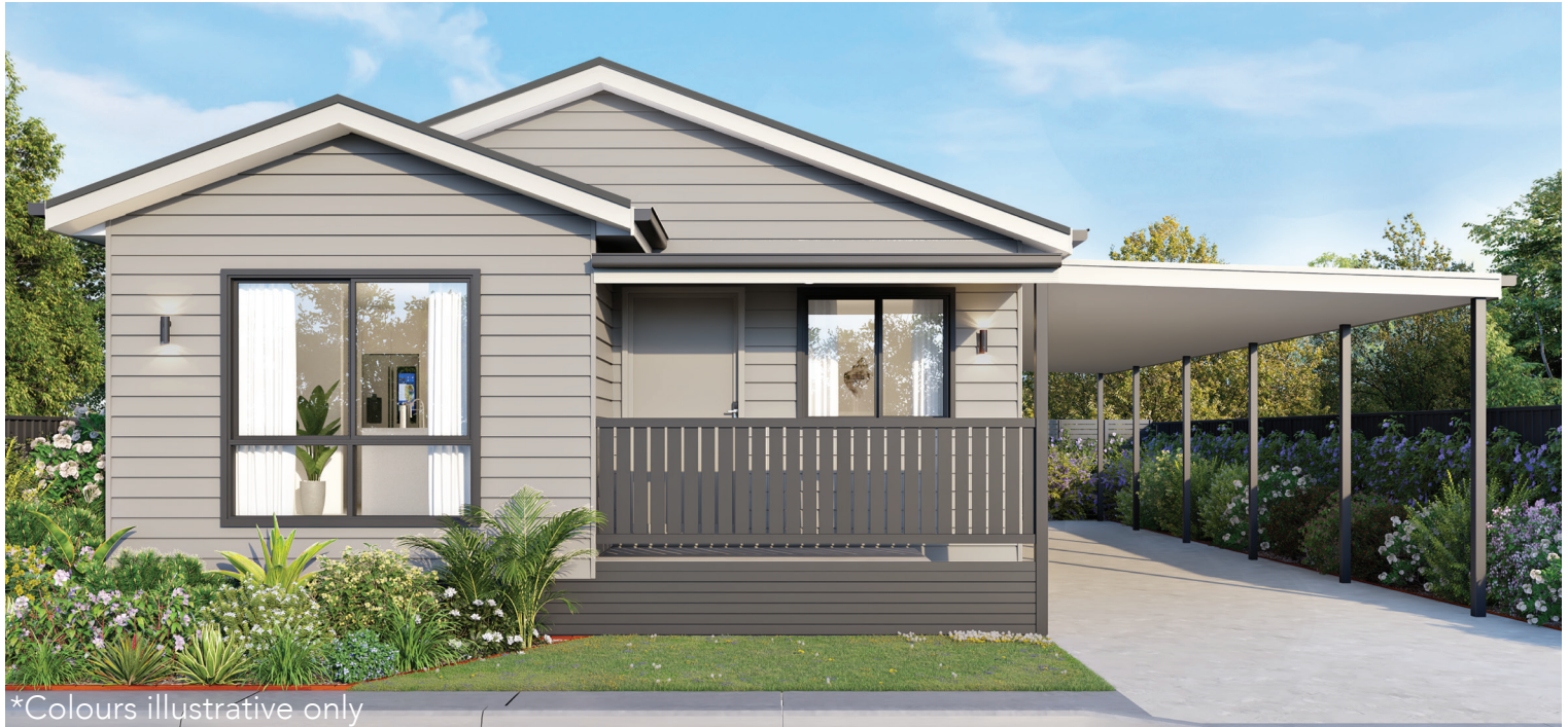
*Colours illustrative only