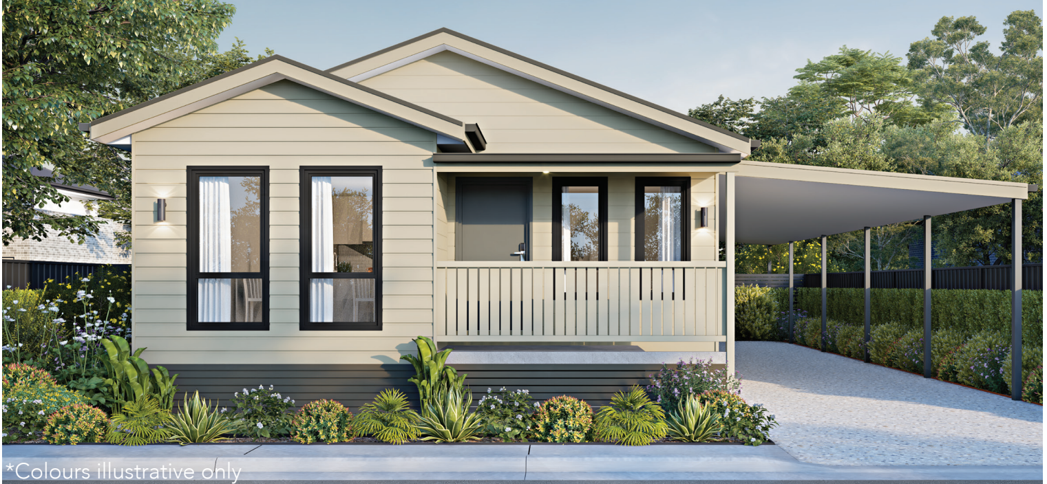
*Colours illustrative only