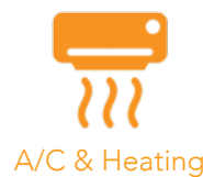
A/C & Heating